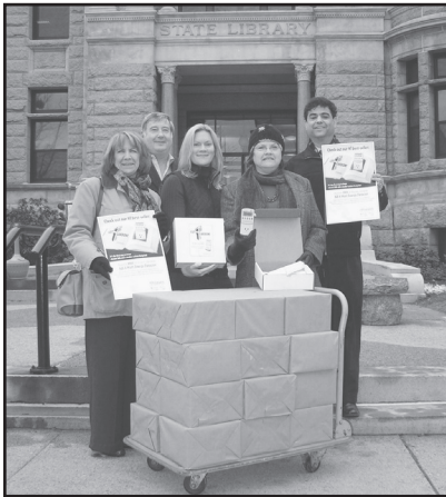
Cut the Carbon kits arrived at the State Library in Concord bound for libraries across the state. On hand were representatives of the NH Public Utilities Commission, Public Service of NH, State Library and NHEC.

Energy efficiency help for homeowners is on the way as hundreds of "Cut the Carbon" kits arrive this month in public libraries across New Hampshire.