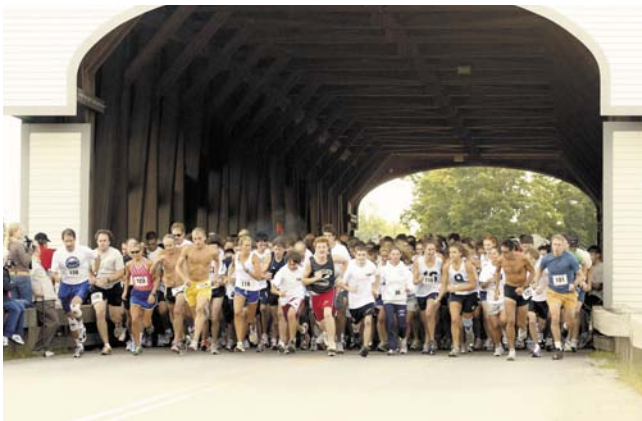
The field is off at the starting gun.

Mark your calendar for the 2008 race and be a part of a new Labor Day tradition!