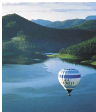
Queensland, Australia – Where the Rainforest meets the Reef

Great Escape Travel Services Alton Bay, NH • 603-875-1747